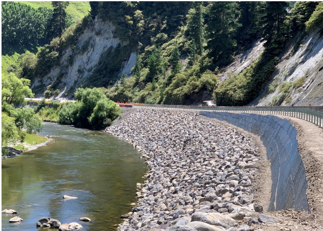
Hapokopoko Riprap & MSE wall (SH4)