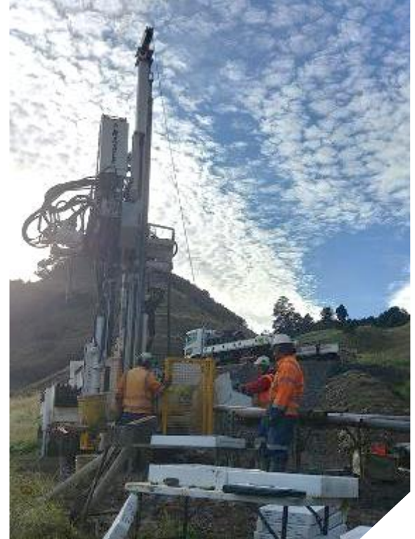
The crew at Te Oreore site drilling boreholes and installing groundwater monitoring devices, deep within the landslide area