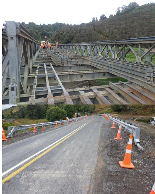
Top image: Pohokura during construction Bottom image: Completed bridge