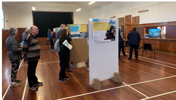
August / September 2020 engagement